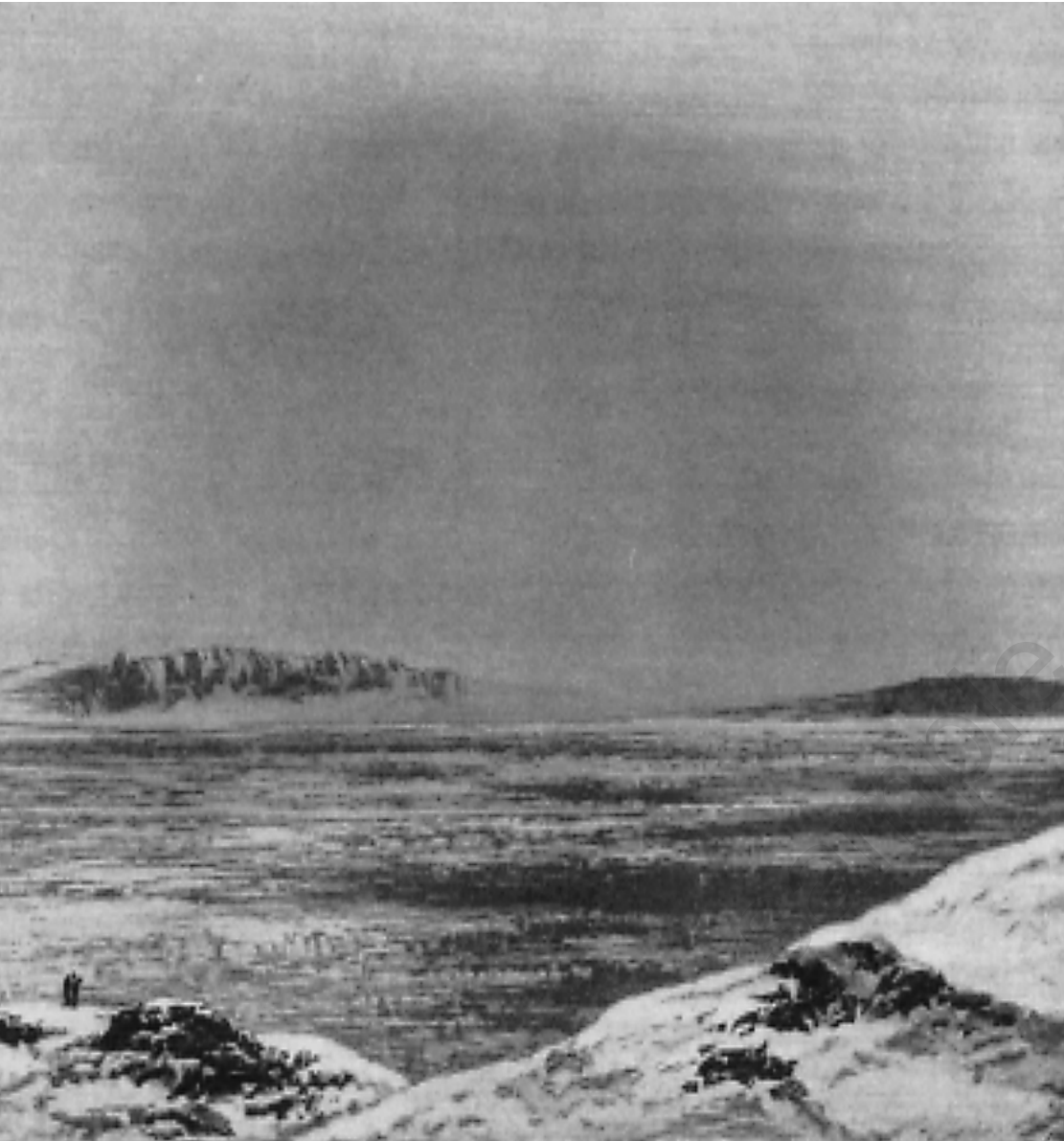
Samuel Gurney Cresswell, "Melville Island from Banks Land," from A Series of Eight Sketches in Colour (together with a Chart of the Route) by Lieut. S. Gurney Cresswell, of the Voyage of the H.M.S. Investigator (Captain M'Clure), during the Discovery of the North-West Passage, London, 1854