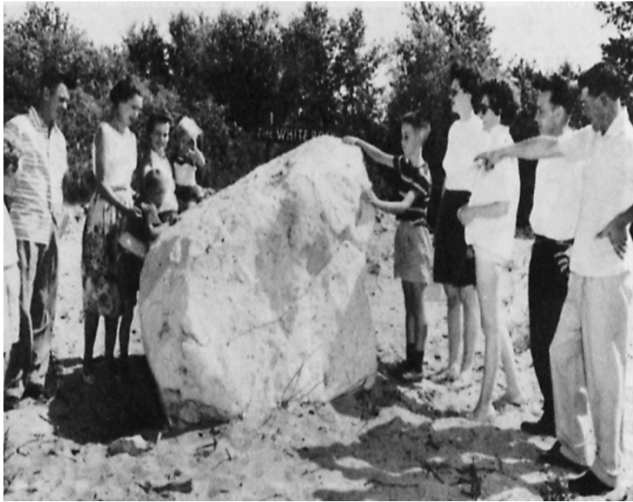
The white rock in its original position The Gimli Saga: The History of Gimli, Manitoba

No documentary evidence from European sources remains to tell us what happened to the Knutsson expedition; but there may be documentation of a sort from North America. In 1898 a stone inscribed with runic characters was found enmeshed in the roots of a tree near Kensington, Minnesota. The inscription translates as follows: