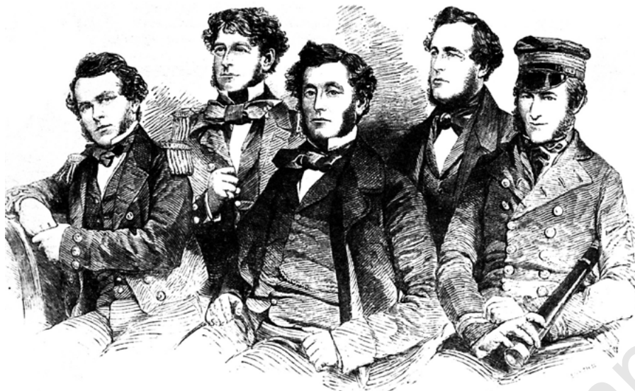
Farley Mowat, Ordeal by Ice

Commanders of the Arctic Searching Squadron, sent out in 1850 in search of Sir John Franklin. Leopold M'Clintock is third from the left.