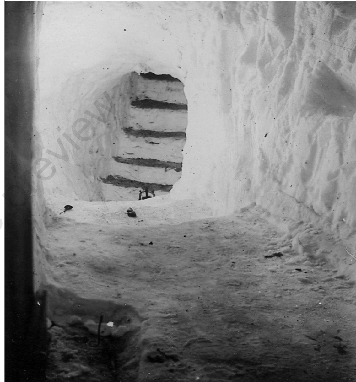
One of the passages, with steps, under the snow