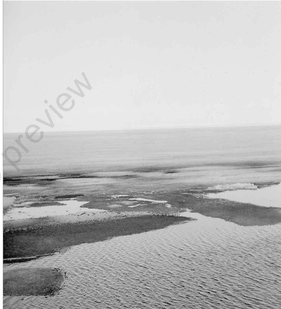
Lake Winnipeg freezing over, November 1996