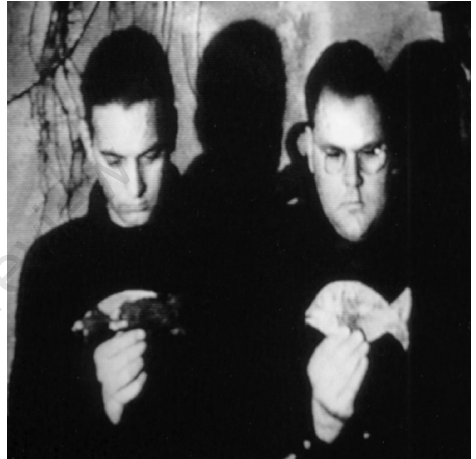
Guy Maddin (director), Tales from the Gimli Hospital

Mary Shelley, Frankenstein, or, The Modern Prometheus