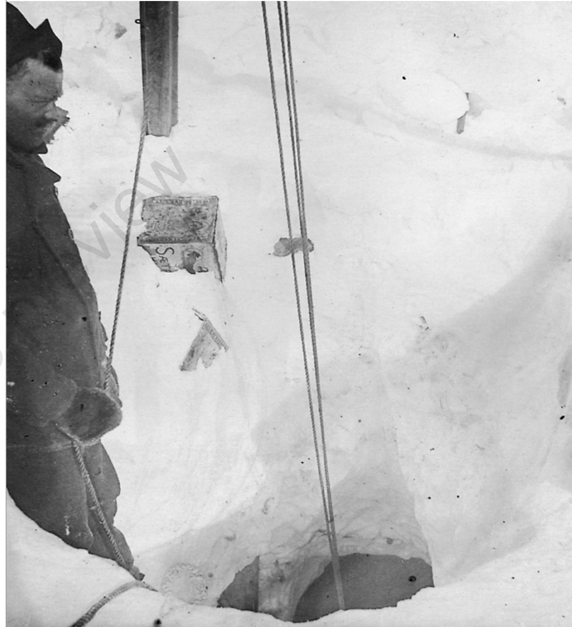
Roland Huntford, The Amundsen Photographs

Far Shores ParaUFO Website—24 HR Worldwide Anomaly Reporting